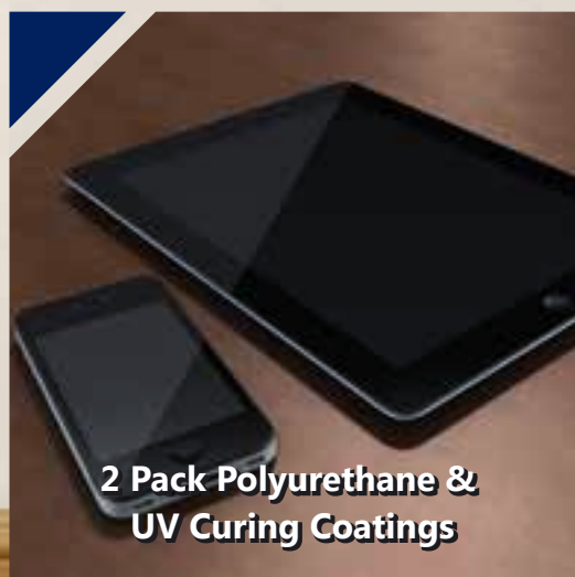
2 Pack Polyurethane & UV Curing Coatings