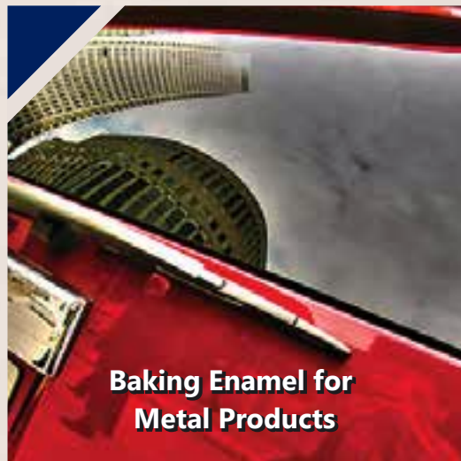
Baking Enamel for Metal Products

Liquid Coatings Powder Coatings Pretreatment Paint Application Techniques